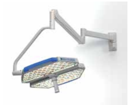
Wall-mounted version: ideal for special infrastructure conditions and procedures