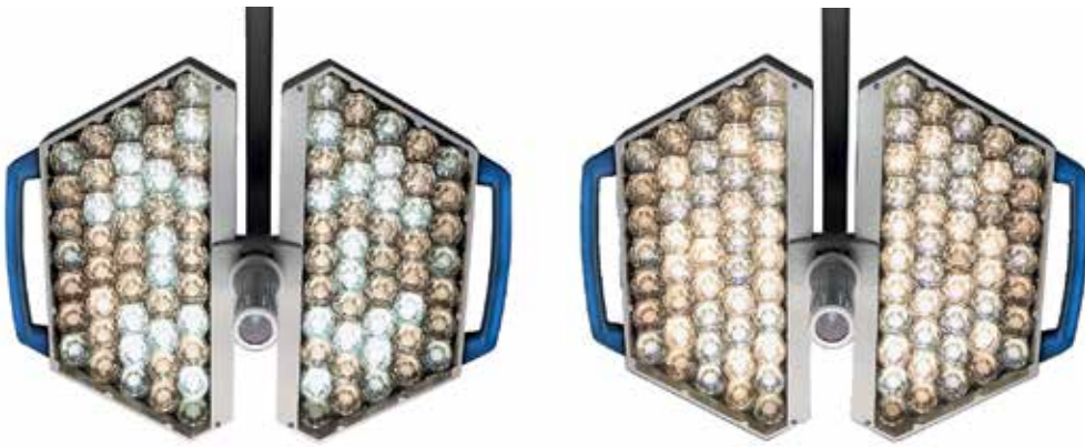
Contrast optimization due to color temperature adjustment of 3,500 to 5,000 K

Every generation has an edge over the previous one. Similarly, in the case of the TL5000 Surgical Light, proven functionality meets technological advancements that have significant impact on the quality of work in the OR. Equipped with adjustable color temperature and pattern size adjustment, the TL5000 Surgical Light offers an exceptional performance range that benefits you during daily use.